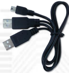
USB-Y-Line-2.0 (USB 2.0 Y-Line cable) x1

U.fl / IPX to RP-SMA female pigtail for wifi RF cable adapter