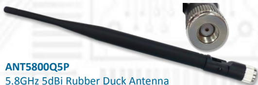
ANT5800Q5P 5.8GHz 5dBi Rubber Duck Antenna