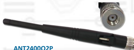
ANT2400Q2P (2.4GHz 2.15dBi Rubber duck antenna)