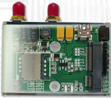
USBMI-D (Wireless USB Mini Card Adapter ver1.1b)x1