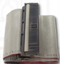
PATA cable x1