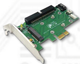
MP2S (mPCIe SSD to PATA /SATA adapter ver1.0b) x1