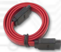
SATA cable x1